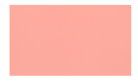
Tint 1:25 TiO<sub>2</sub>